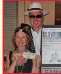
UF Physicians raised $517.00 in tips.

Thanks to the Shands Healthcare Teams and sponsors who participated in the 2005 Celebrity Waiter Night!