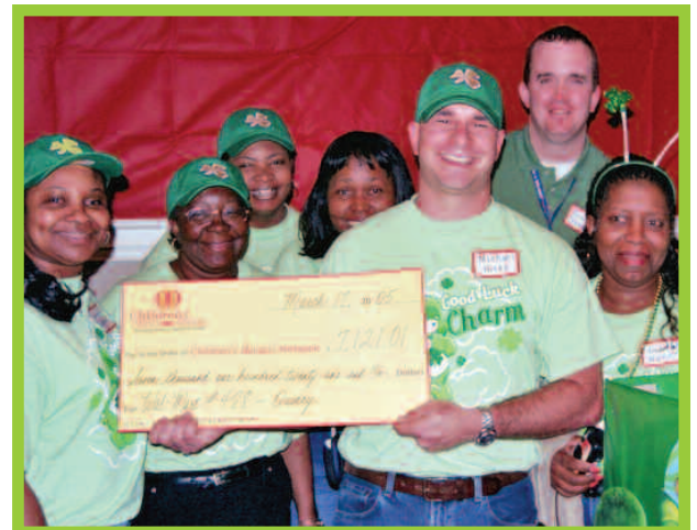
Wal-Mart Day 2005, Quincy Team, Store # 488