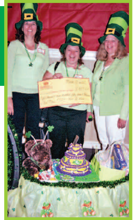
Wal-Mart Day 2005, Fort Pierce Team, Store # 929

A special recognition to Shands Safety, Security, and Transportation and Shands Healthcare professionals who volunteered their time in assisting Children’s Miracle Network during the event and for their dedication in providing the best quality of care to the patients treated at Shands Children’s Hospital.