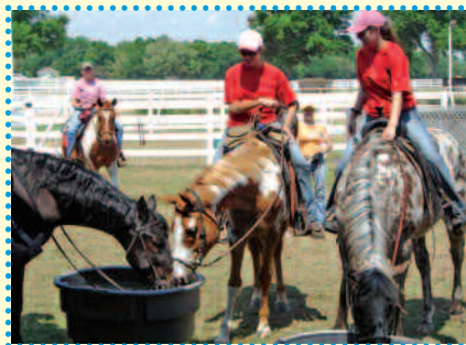
After the 10-mile ride in the Florida Greenway, horses enjoyed a drink of water.