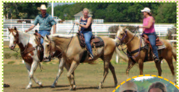
155 riders came from across Florida to participate in the 10-mile scenic ride.