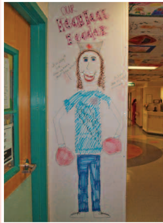
"If it is not moving, paint it". Temporary construction wall

Visit our online store to purchase your Children's Miracle Network items. www.shandskids.org 800-284-6472