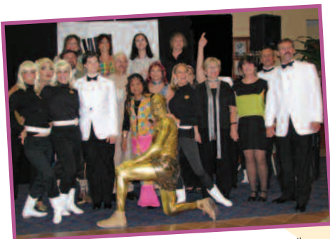
The Facilities team presented James Bond's "Goldfinger".