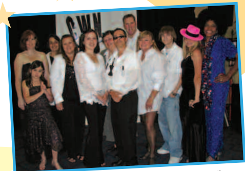
Information Services team as James Bond's "JAWS".