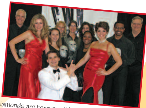
Diamonds are Forever with the Nursing, Operations, Pharmacy & Rehab team.